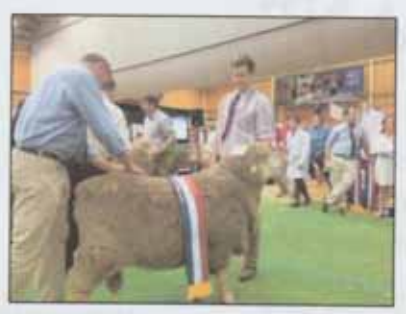
What a good ram!

2014 Grand Champion August Shorn Poll Ram –