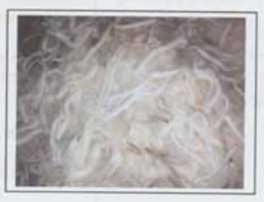
Typical Orrie Cowie fleece wool. At the Dubbo National Merino Show our ewe fleece entry was valued at $79.80, just $1.30 under the highest value ewe's fleece for the show.