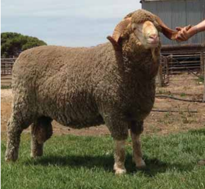
OC Trojan (Jan 2016)