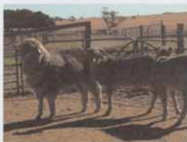
Tara and 2 sons 151305 & 151303 (sons at 5 ½ months old)

151305 (left) and 151303 (right), both with great heavy cutting wool- growing skins, oozing quality crimp, white waxy nourishment with density. They are also well structured and at 5 ½ months old, showing rapid growth rate and very big heads.