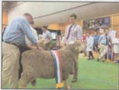
2014 Grand Champion August Shorn Poll Ram –