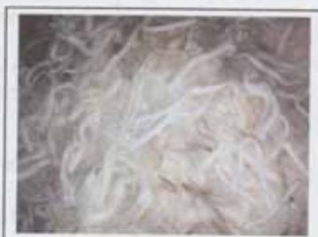
Typical Orrie Cowie fleece wool. At the Dubbo National Merino Show our ewe fleece entry was valued at $79.80, just $1.30 under the highest value ewe's fleece for the show.