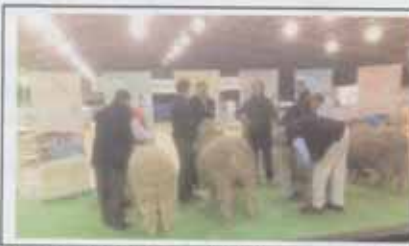
2014 - SA Ram of the year Titan at the Rabobank National Australian Ram of the Year judging, Dubbo, 2014. He certainly did "strut his stuff".

He was sold at the Dubbo ram sale for $25,000, topping the whole sale offering. He sold to Gundarimbah and Overland Poll Merino studs with NZ semen interests to the Maryburn, Armidale and Gray Hills Merino studs. Titan has tested resistant to footrot as a 1/1.