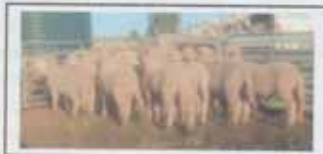
His lambs are large and very uniform, looking like heavy-cutters with stylish, white crimped wool which is soft, nourished on supple skins

He was sold at the Dubbo ram sale for $25,000, topping the whole sale offering. He sold to Gundarimbah and Overland Poll Merino studs with NZ semen interests to the Maryburn, Armidale and Gray Hills Merino studs. Titan has tested resistant to footrot as a 1/1.