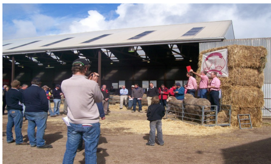
2011 On-property sale

Congratulations to all the purchasers of rams at the recent on-property ram sale on August 10th.