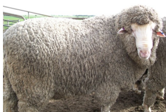
LOT 2 Rambo 102598 Dual purpose