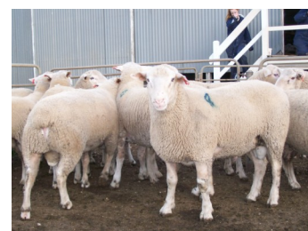
2011 drop WS rams

A rising plane of nutrition, coming off score 3 at joining is essential for the full 5-6 weeks and then careful maintenance of this body score for 2-3 weeks. For the next month just letting the ewes tick along without lots of supplementary feeding is good. At 6 weeks after joining, scanning for singles/twins and drys will give you 3 mobs each with a very different feed requirements. A twin bearing ewe has about 2.5x the feed requirements of a ewe bearing a single.