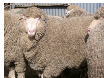
LOT 9: Prince 102792

1/2 brother to $12,000 ram last year, Younger