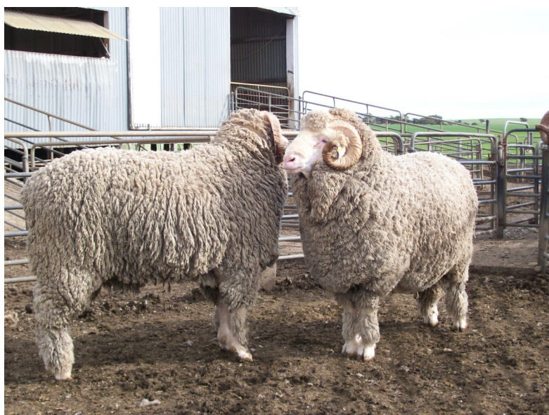
Jolson 100053 and OC Exceller 042539 (having a chat)

WATCH OUT FOR THOSE POLLS they're taking over and starting the sale