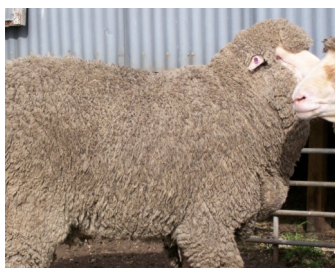
LOT 1: Exceller 100005

Great structure, gutsy quality 58/60's wool