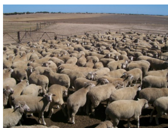
2012 feedlot lambs

Last year we put over 2,000 lambs through the feedlot, Lambs out of Orrie Cowie merino ewes mated to our Redwood White Suffolk rams were amongst the quickest to finish while pure Orrie Cowie merino/poll merino lambs took 9-10 months to sell as heavy lambs. Feeding well bred lambs is easy.