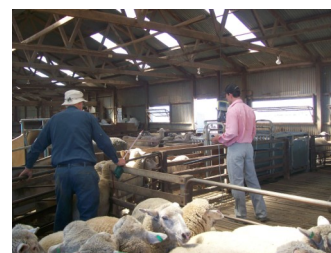
Weighing lambs regularly

Last year we put over 2,000 lambs through the feedlot, Lambs out of Orrie Cowie merino ewes mated to our Redwood White Suffolk rams were amongst the quickest to finish while pure Orrie Cowie merino/poll merino lambs took 9-10 months to sell as heavy lambs. Feeding well bred lambs is easy.