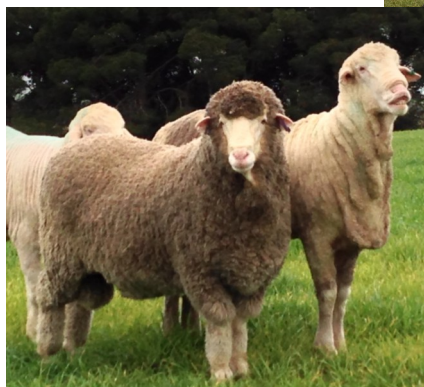
"Duke" 122510