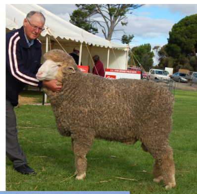
"Exceller 108"