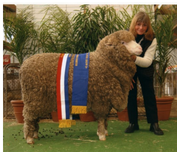
Cut 15kg wool blade shorn and weighed 110kg BW bare shorn

----- & YOUR PURCHASE IS GUARANTEED TO PERFORM