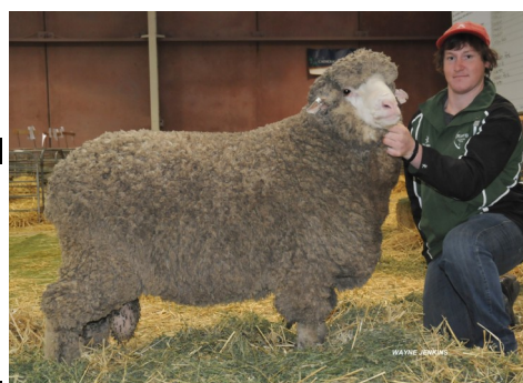
NEW PURCHASE 2013