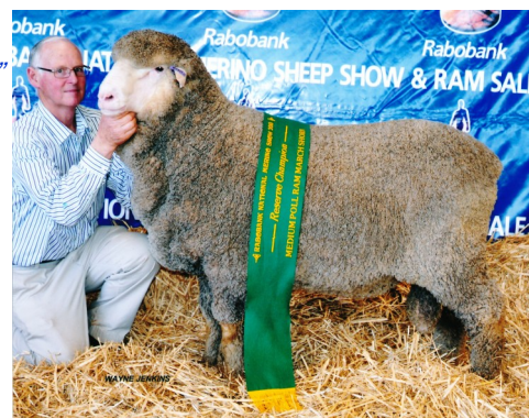
Reserve Champion Medium Wool Autumn Shorn Poll Merino Ram at Dubbo Sheep Show 2013