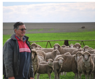
1st ram sale 1966

----- & YOUR PURCHASE IS GUARANTEED TO PERFORM