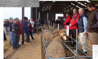
Ram sale 2014