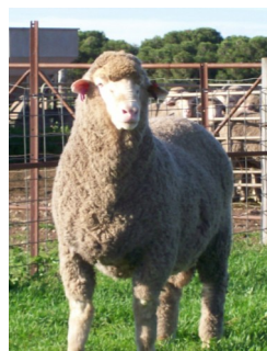
"Son of Eclipse"