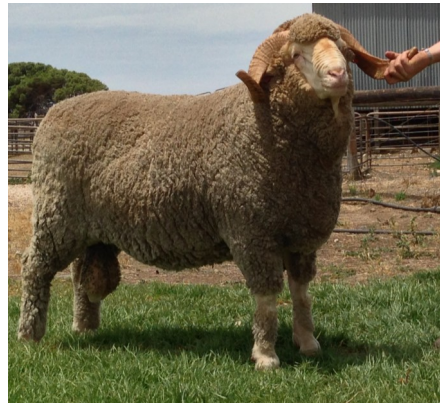
OC Trojan (Promoter 181—140050)

----- & YOUR PURCHASE IS GUARANTEED TO PERFORM