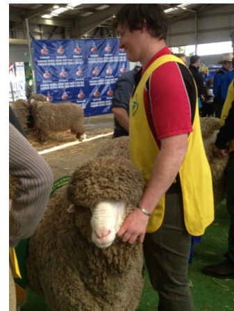
OC Silky (OC Exceller 556-30242)

2014 Sold for $25,000 to Overland and Gundarimbah Studs