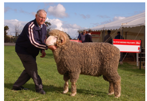
OC Exceller 108