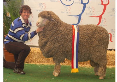
OC Titan (OC Regal122523)