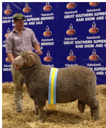
OC Exceller 100 (Exceller 026 —140100)